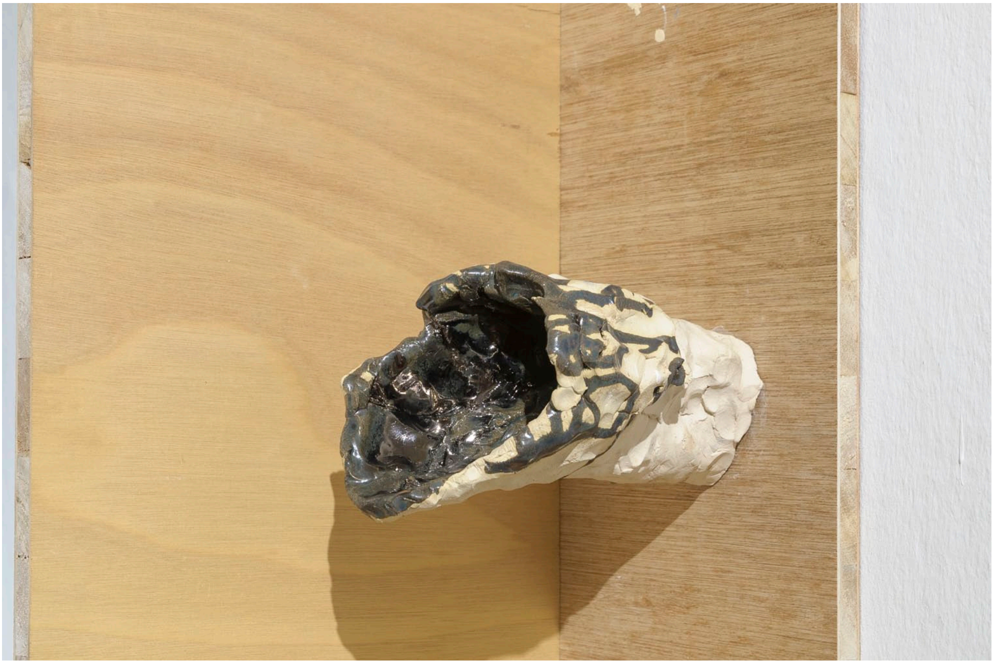
Schlund (detail), 2016 90 x 34 x 22 cm glazed ceramic, wood