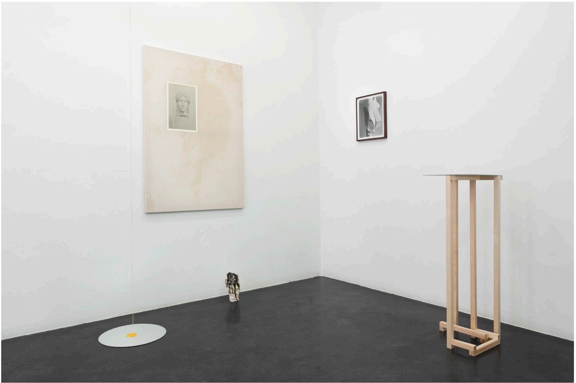
installation view Lage Egal, Berlin 2016