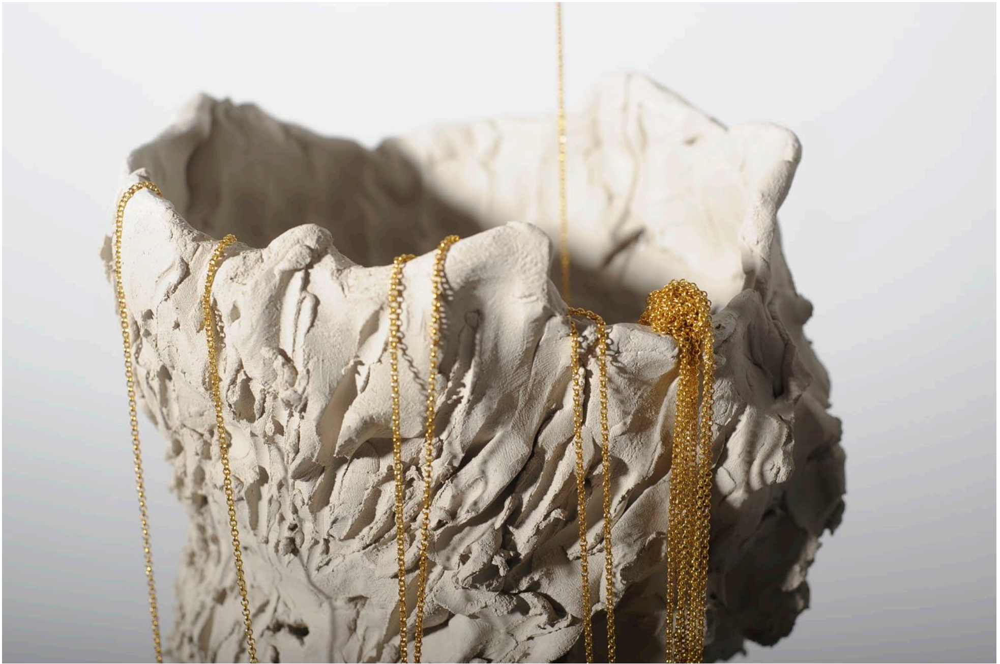
Goldstandard (detail), 2014 ceramic, gold chain dim variable