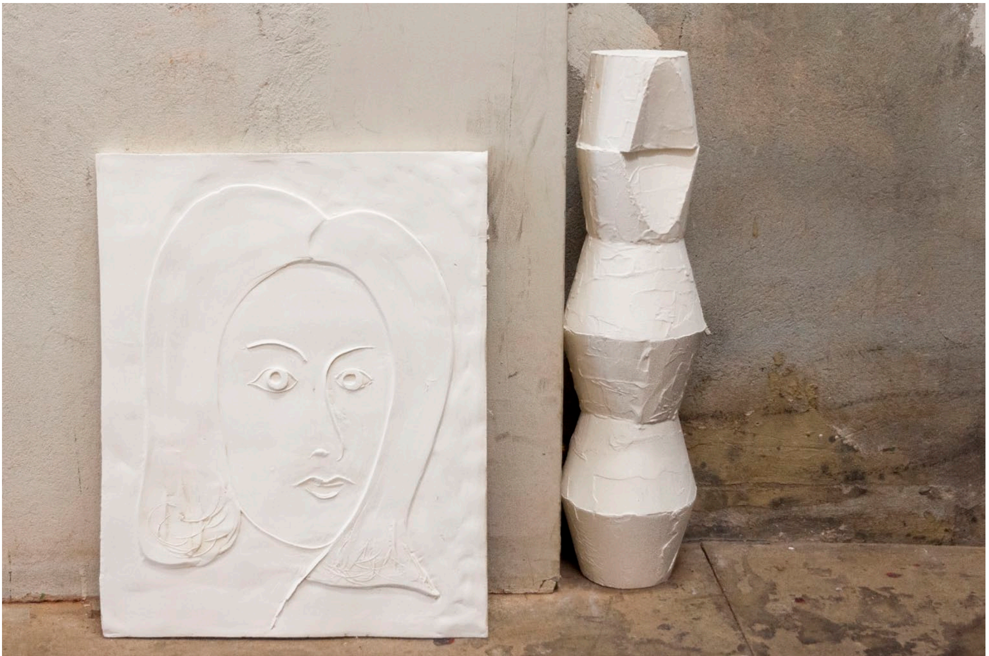
Untitled (working girl) , 2015 plaster 45 x 32 cm