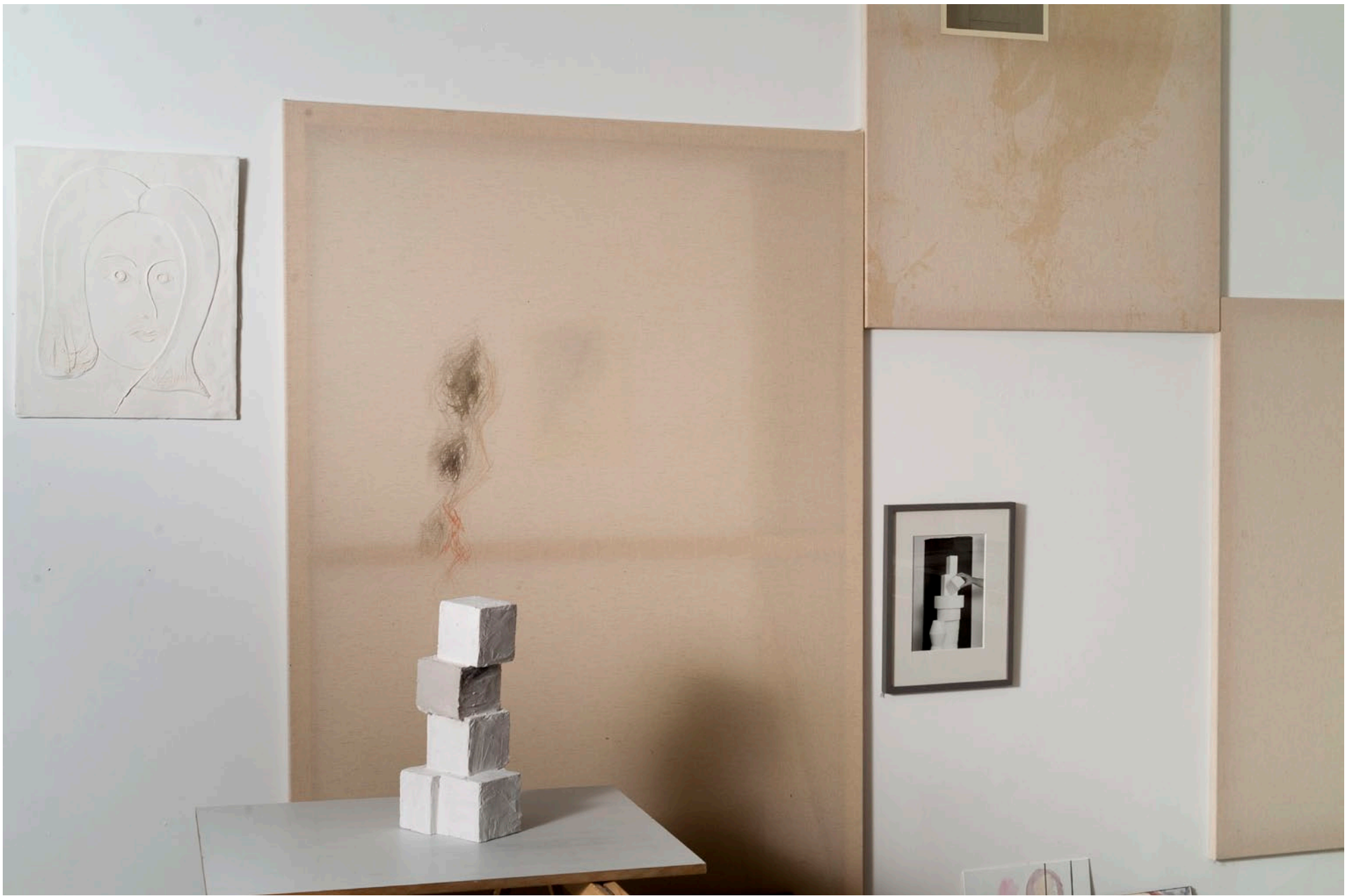
studio view, 2016