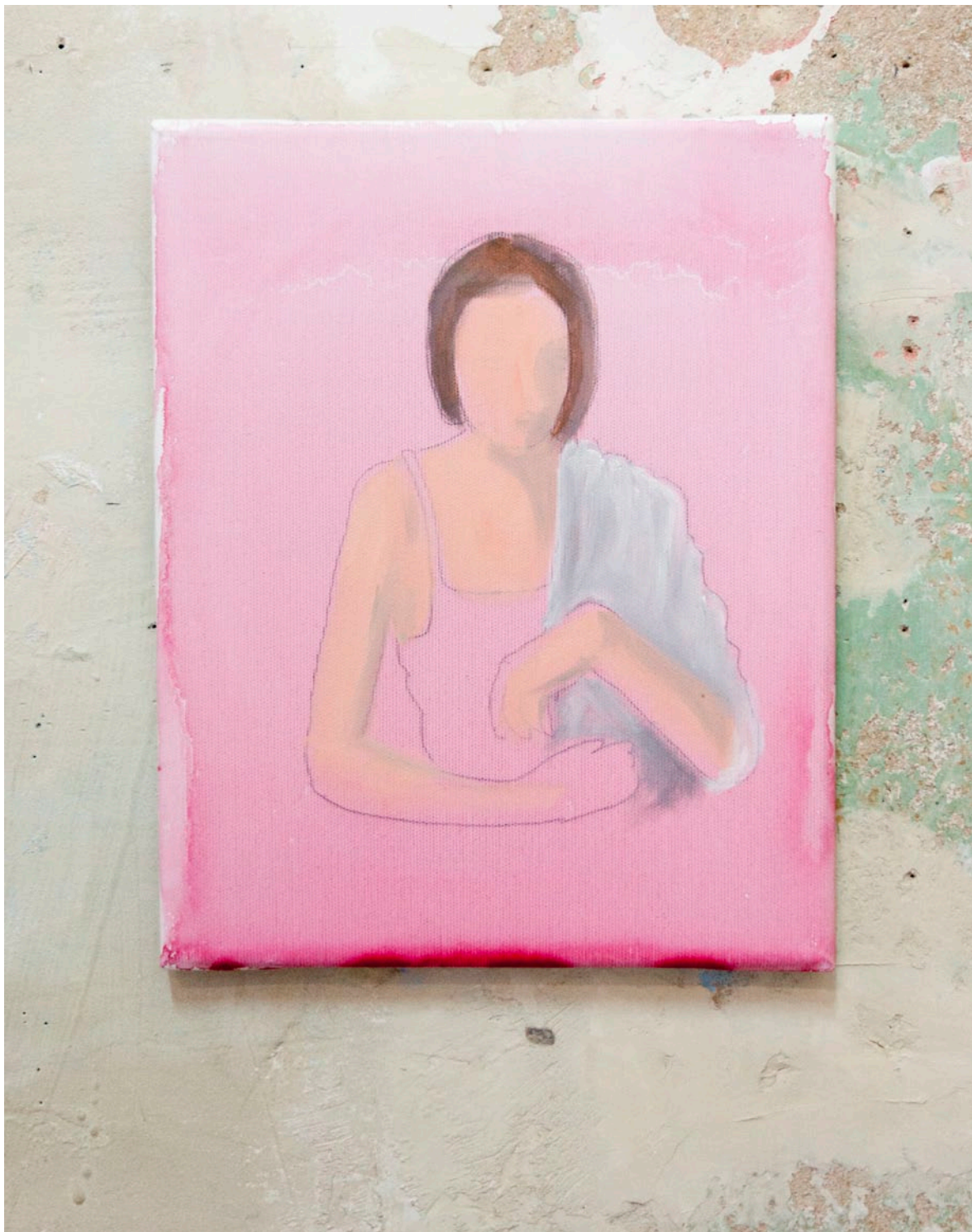
untitled (study for a representational painting) , 2015 oil on canvas 30 x 24 cm