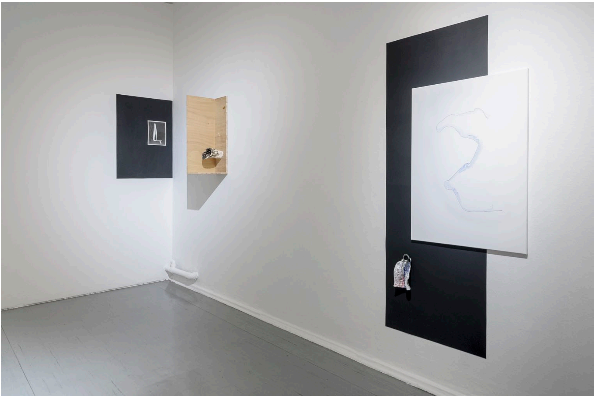
Installation view Kollision. Im Labyrinth der unheimlichen Zufälle, Kunstraum Kreuzberg/Bethanien, Berlin 2016