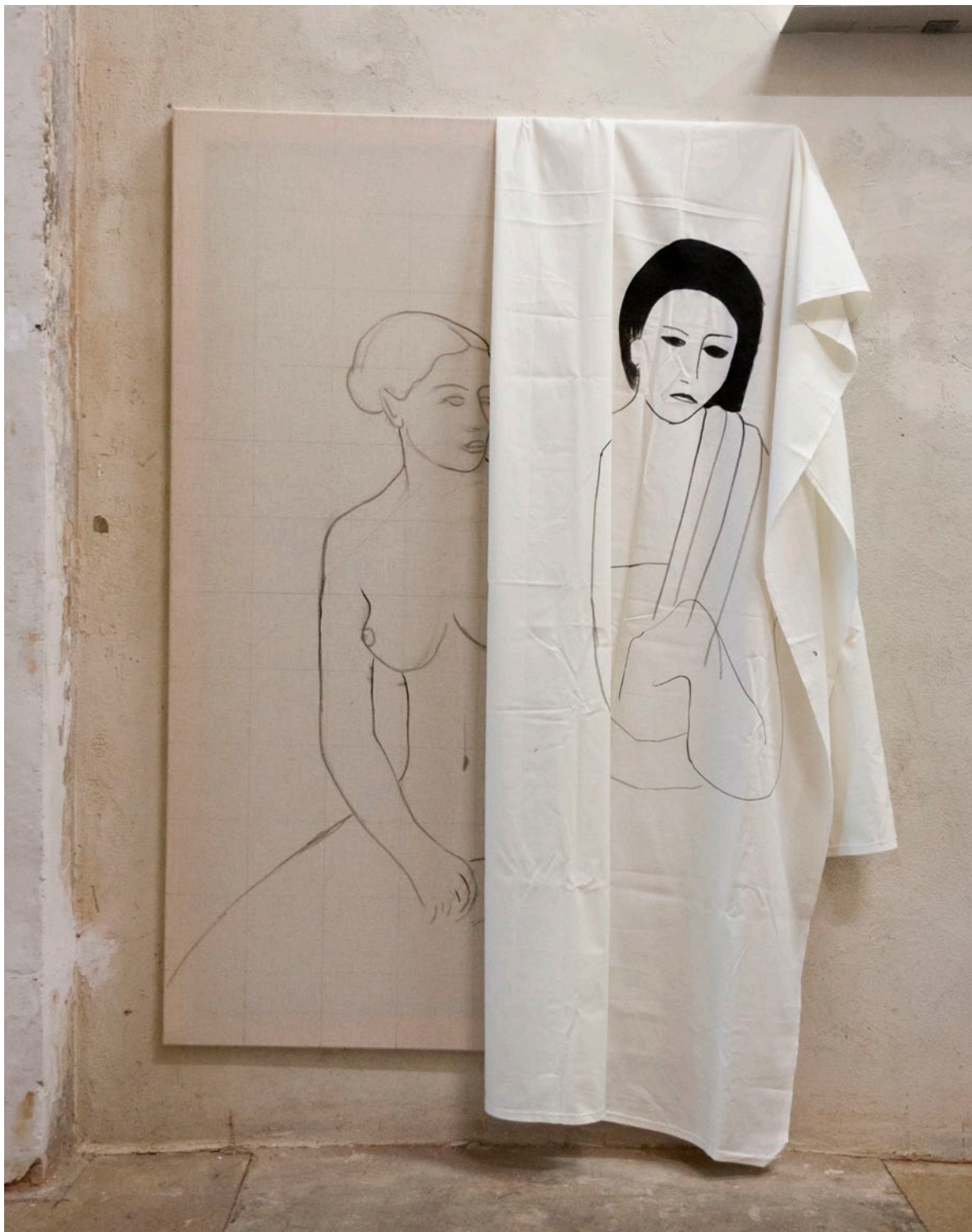
untitled (study for a representational painting) , 2015 ink on canvas 162 x 117 cm