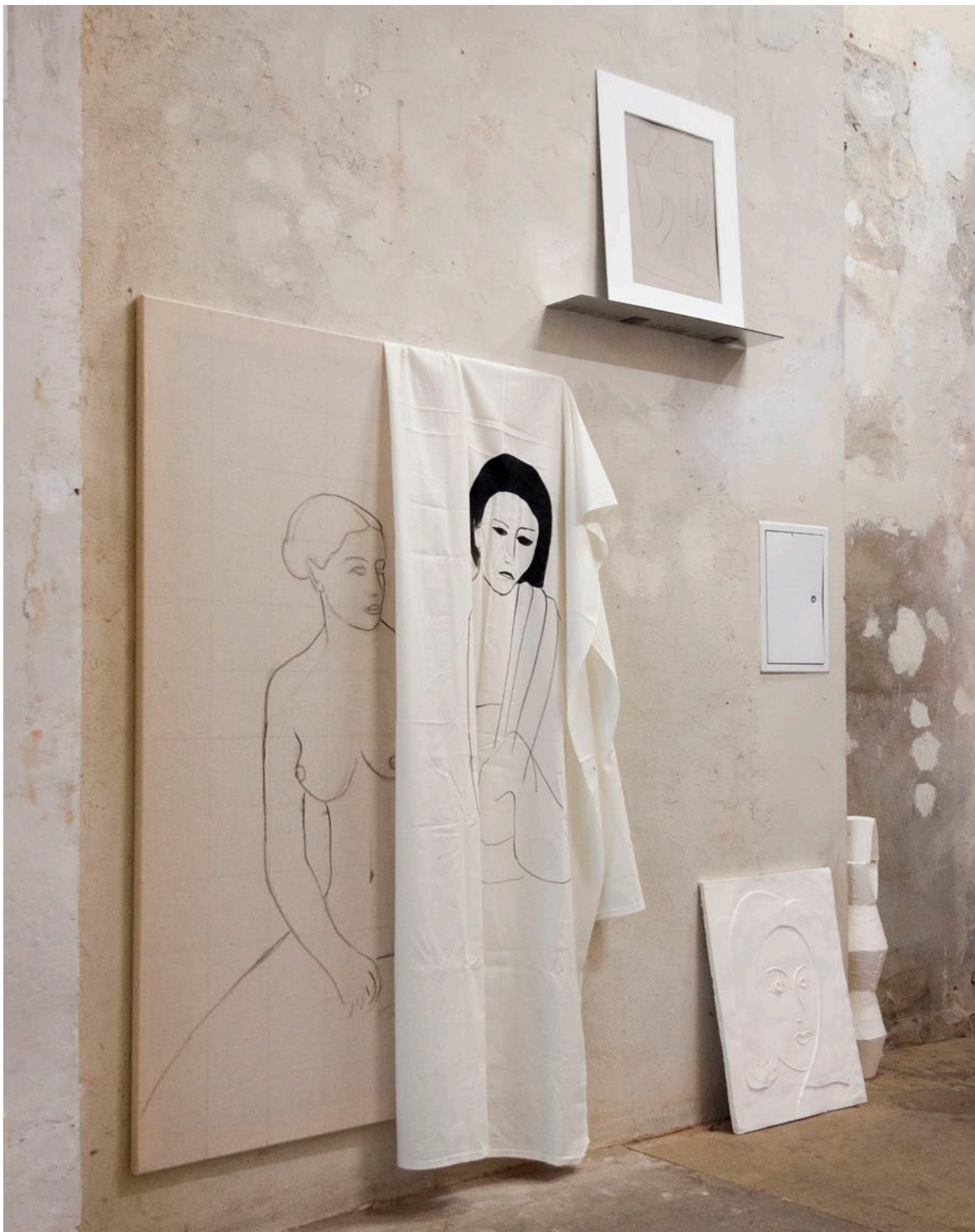
untitled (study for a representational painting) , 2015 ink on canvas 162 x 117 cm