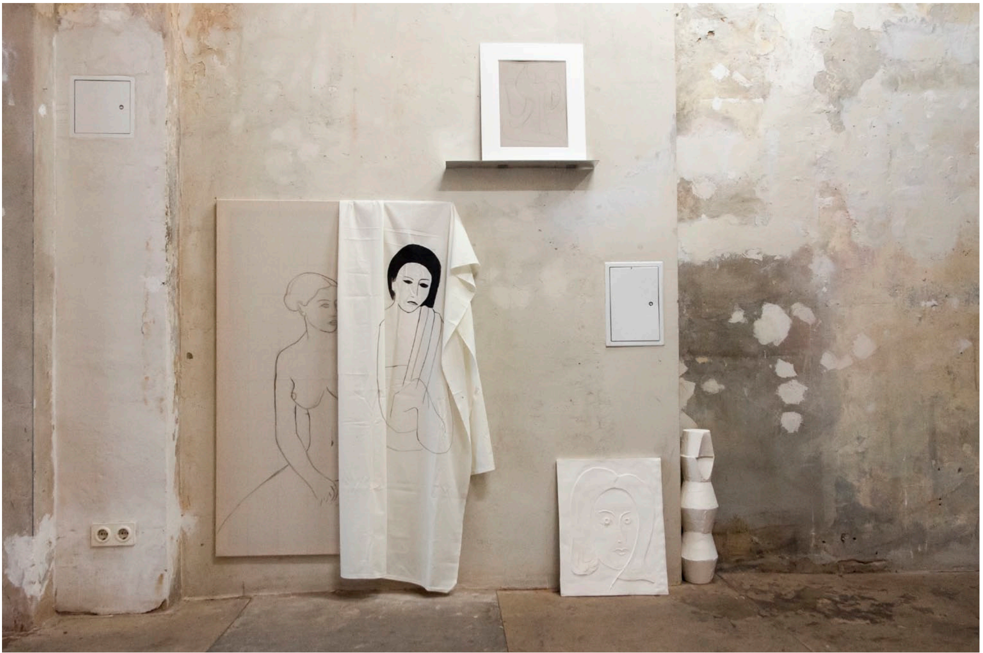
installation view Das Minol Haus, Tête, Berlin 2015

The exhibition searched to investigate into notions of realism, especially observing the 1920's retour a l'ordre as a means of producing a consensual modernity in accelerated societies - east and west.