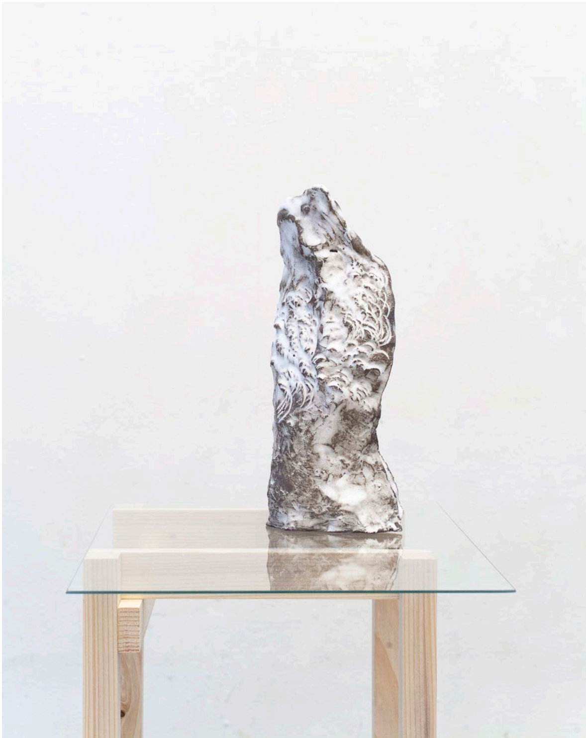
study for angel , 2014 glazed ceramic, pedestal made from glas, wood 23 x 9 x 5 cm