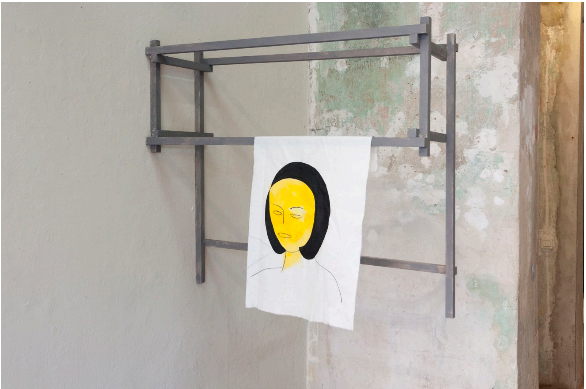
Untitled (constructivist working girl) , 2015 ink and watercolour on canvas, wood 76 x 110 x 35 cm