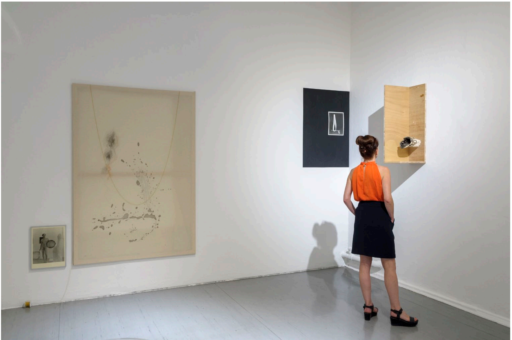
Installation view Kollision. Im Labyrinth der unheimlichen Zufälle, Kunstraum Kreuzberg/Bethanien, Berlin 2016