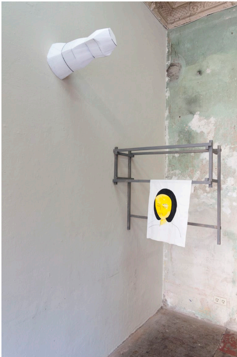
Monument , 2015 styrofoam 23 x 17 x 42 cm